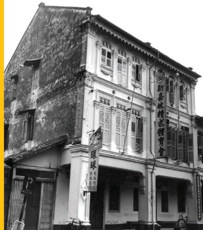
Since its founding in 1921, the Chin Woo Association had moved a few times before relocating to its current premises at 90 Neil Road in 1940, where it remains to this present day.