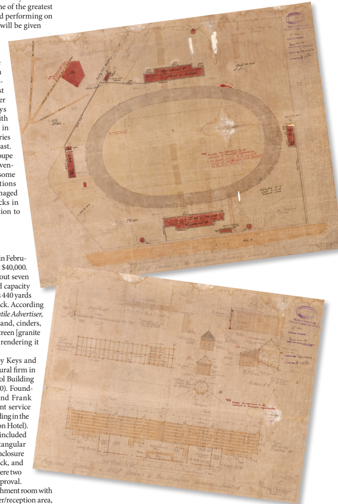
Original plans drafted by Keys & Dowdeswell in 1930 for the proposed Speedway.

The buildings at the Speedway included three octagonal ticket kiosks, a rectangular shed with seating for spectators, an enclosure for motorcyclists adjacent to the track, and men's and women's lavatories. There were two updates to the plans submitted for approval. The first was for the removal of a refreshment room with a bar counter, a "crush hall" or a foyer/reception area, and a manager's office from the design. The changes might have been made to lower costs and/or accelerate the project's completion. The second update was for additional seating along the racetrack.