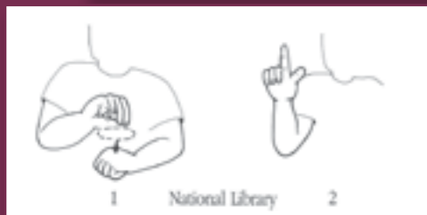
1 National Library 2