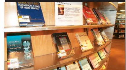
Books by the late Peter F. Drucker, the founding father of management.

Forbes and The Edge are examples of business periodicals available for reference.