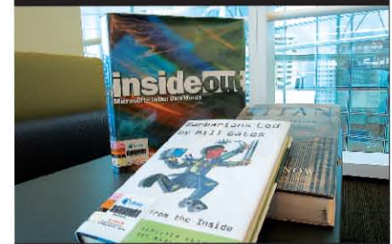
Case studies on business enterprises, such as Microsoft, are available.