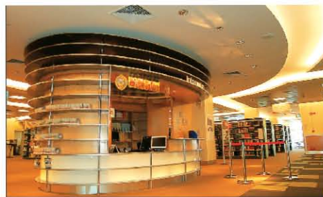
Customers can approach the librarian at the Information Counter for assistance on business enquiries or browse through the myriad titles at the Business Collection.

Focusing primarily on the Asia Pacific, Europe and North America regions, the 26,000-strong collection boasts of comprehensive and updated directories, market research reports, statistical and financial sources. It also includes more than 400 trade and business journal titles, world business news as well as management best practices in both print and electronic formats.