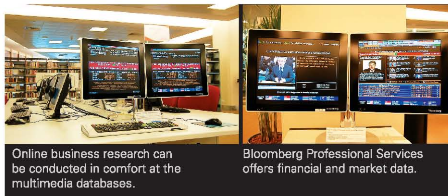
Online business research can be conducted in comfort at the multimedia databases.

To ensure that the Library meet current and future information business needs, it also organises library tours and dialogue sessions with business and trade associations. If you would like to learn more, do email to the Business Collection librarians at: ref@nlb.gov.sg