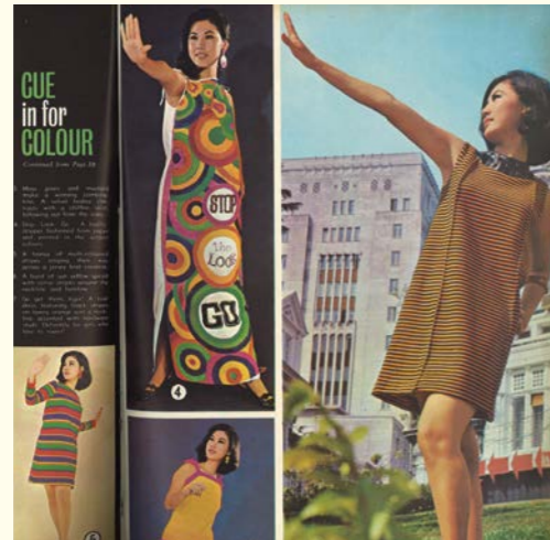
Knee-length A-line dresses were popular in the 1960s.

The local fashion scene was extremely vibrant towards the end of the 1970s, with fashion shows held at upscale venues such as Grand Hyatt, Hilton, Holiday Inn, Raffles Hotel and the Mandarin Orchard. In 1979, European fashion houses Louis Vuitton, Gucci and Christian Dior each opened their first boutiques in the city-state. These laid the foundation for Singapore's fashion world to enter its golden era in the next decade.