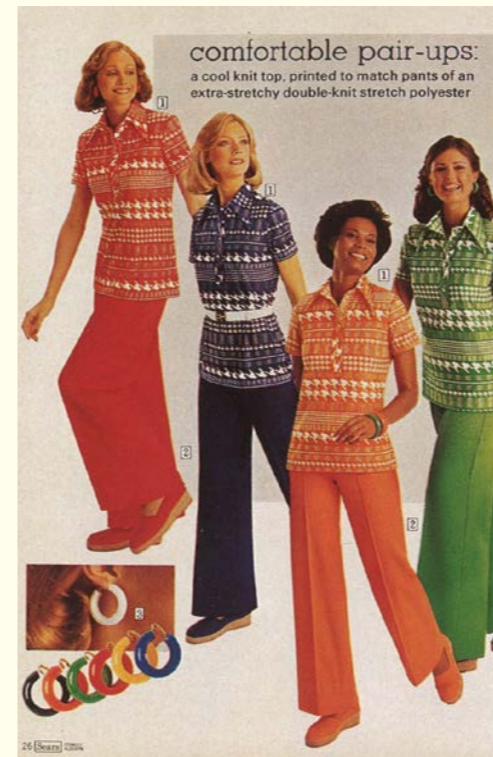
Flared-leg pants, such as bell-bottoms, were styles characteristic of the 1970s. Fashionable Clothing from the Sears Catalogs: mid 1970s , p. 42. All rights reserved, Schiffer Publishing Ltd, Pennsylvania, 2014.