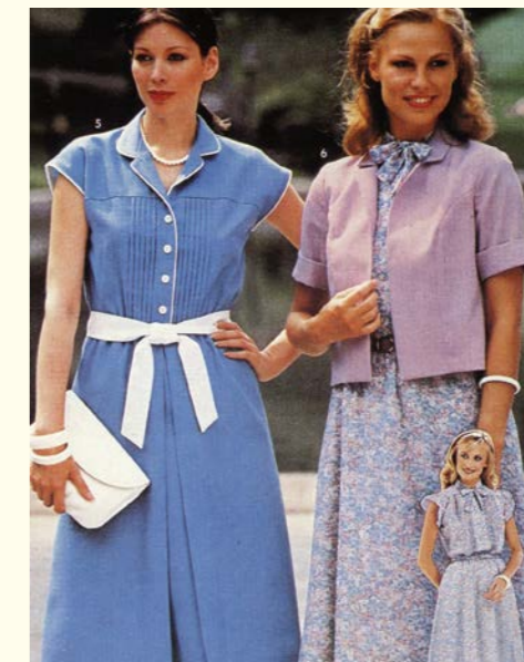
With more women entering the workforce, designers began to focus on this new market. Fashionable Clothing from the Sears Catalogs: early 1980s , p.96. All rights reserved, Schiffer Publishing Ltd, Pennsylvania, 2014.

"Yuppies", a term coined for young urban professionals in the 1980s, were a new breed of ambition-driven and materialistic young people who presented a niche market for the fashion trade. Designers began to target and create apparel that was in keeping with yuppie lifestyle aspirations and fashion sensibilities.