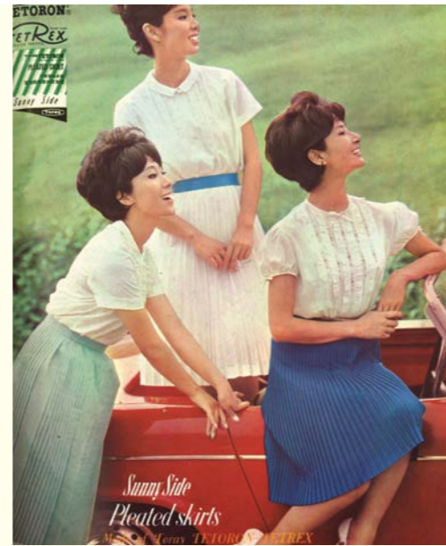
An advertisement for pleated skirts. Her World , April 1964, inside back cover.

For local fashion, the prevailing style of the late 1960s was clean lines, neat shapes and a trapeze silhouette, with the A-line shift dress being the defining shape of the time and the mini skirt as the phenomenon of the decade.