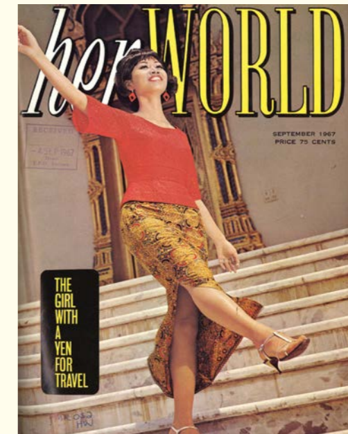
Front covers from Her World November and September 1967.

In May 2014, the Asian Fashion Exchange was held, celebrating the best of Asian fashion and designers and doubling as a platform for young emerging talent to showcase their collections. To tie in with the event, the National Library held a week-long retrospective on the fashion trends of past decades with a display of books and women's magazines.