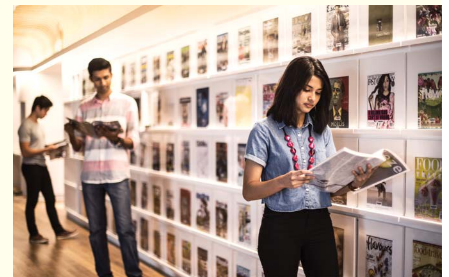
Visitors browsing through publications at the wall of magazines, which houses the largest collection of design and creative titles found in any public library in Singapore.

With so many new features available at library@orchard, endless possibilities await. We welcome you to keep coming back for more. ♦