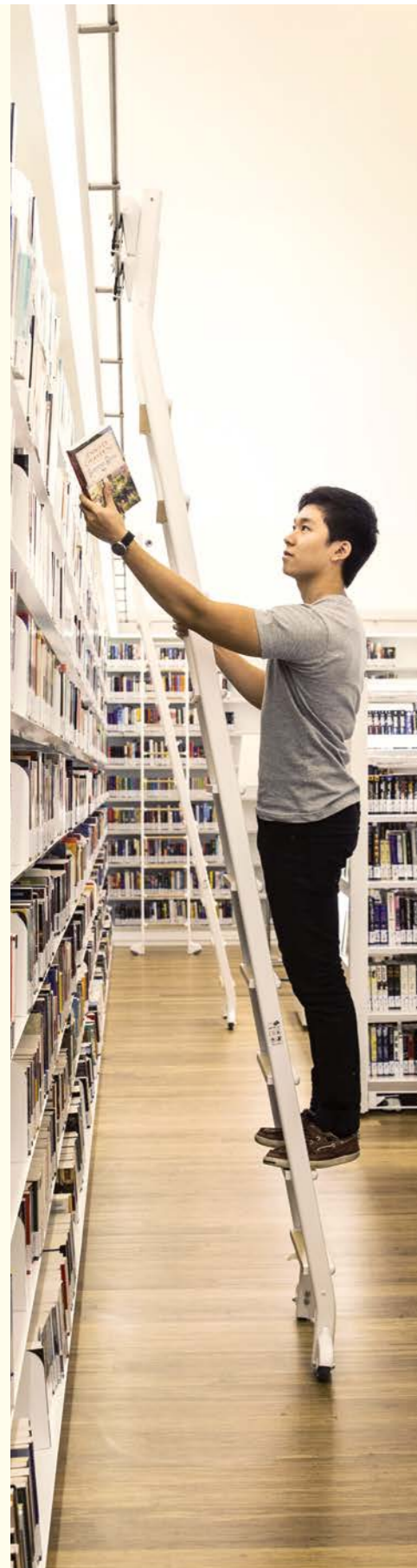
Bookshelves in the revamped library span floor-to-ceiling.