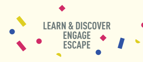
Using the principles of Design Thinking, the National Library Board worked closely with Singapore Polytechnic and the public to develop library@orchard.