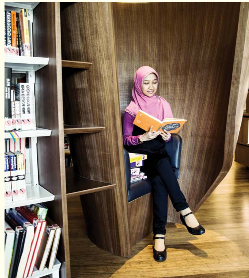
These intimate pod-like cocoons allow undisturbed reading. There are five of such seats in the upper level.

Hint: In true library fashion, library@orchard has arranged the books to form a narrative with sections on People, Space, Product, Visual and Lifestyle. It all starts with People. One of the most basic needs besides food, air and water is shelter. People naturally want a Space to occupy and make their own. Then come Products to decorate your space and Visuals to help you to decide on the products you need. After furnishing your space, you will realise that the items you have chosen actually reflect your Lifestyle.