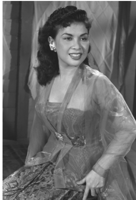
Actress-producer Maria Menado (of the Pontianak movie fame) in 1960.

Following the strikes, Cathay-Keris released one of the most notable cult films in the Malay movie industry, Pontianak (1957), starring the radiant kebaya -queen from Indonesia, Maria Menado. The ghoulish tale of a beauty-turned vampire who could only be killed with a nail driven into her skull was directed by B.N. Rao. The phenomenal success of Pontianak – which spawned the sequel Dendam Pontianak (Pontianak's Revenge) in the same year and consequently the horror film genre – heralded the arrival of Cathay-Keris as a formidable opponent in the industry. 20 Menado, too, rode the crest of her success in the Pontianak films to become