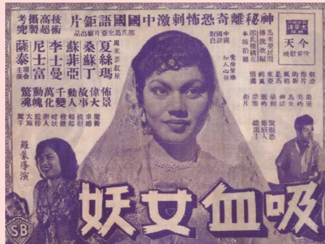
A Chinese flyer promoting Anak Pontianak (1958). Directed by Roman Estella, produced by Malay Film Productions Ltd. Singapore/Hong Kong, 1958.

Selepas perang, Shaw dan Cathay melihat kesan positif dari penggunaan sarikata (sub-titles) yang telah merancakkan lagi sambutan terhadap tayangan filem-filem bahasa asing mereka. Peminat filem dari masyarakat Melayu yang berduyun-duyun ke Taj dan Garrick di Geylang dalam 50an dan 60an terkena demam Bollywood kerana dapat memahami filem hindi menerusi sarikata yang disediakan dalam Bahasa Melayu. Bahkan sedekad sebelum Dev Anand memukau penonton Melayu dengan aksi pertarungannya yang hebat, penonton-penonton Cina di Singapura yang tidak fasih dalam bahasa Inggeris tertarik untuk menonton filem-filem dari Amerika dan Britain kerana tersedianya sarikata dalam bahasa Cina. Sekumpulan pakar dan operator penterjemah telah digajikan untuk menyiapkan sarikata filem. Pada 1948, dilaporkan hanya segelintir sahaja menjadi tenaga pakar ini dan mereka dikatakan memikul tugas yang paling sukar dan teruja dalam industri perfilman. Untuk filem blockbuster Hamlet yang ditayangkan dalam 1948, Cathay telah melantik seorang siswazah dari Hong Kong, Lau Shing-yuen, untuk menterjemah dan menyiapkan slides dalam bahasa Cina, yang kemudian dipancarkan ke skrin kecil di