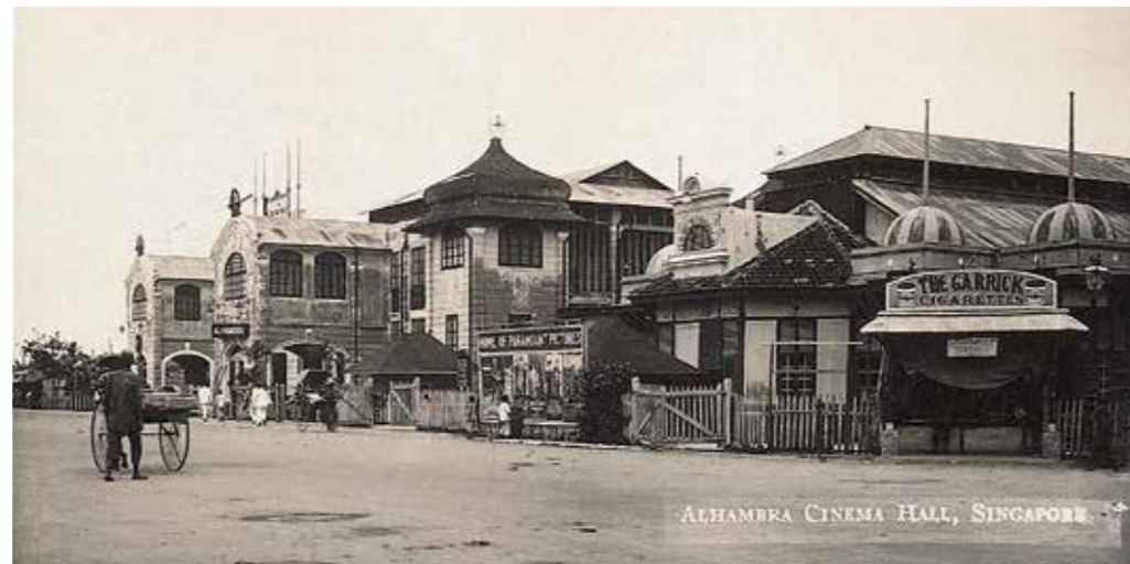
(Above) Adelphi Hotel on Coleman Street, as seen in a 1906 postcard. Adelphi Hall, where Singapore's earliest film screenings were held in 1897, was part of the hotel.