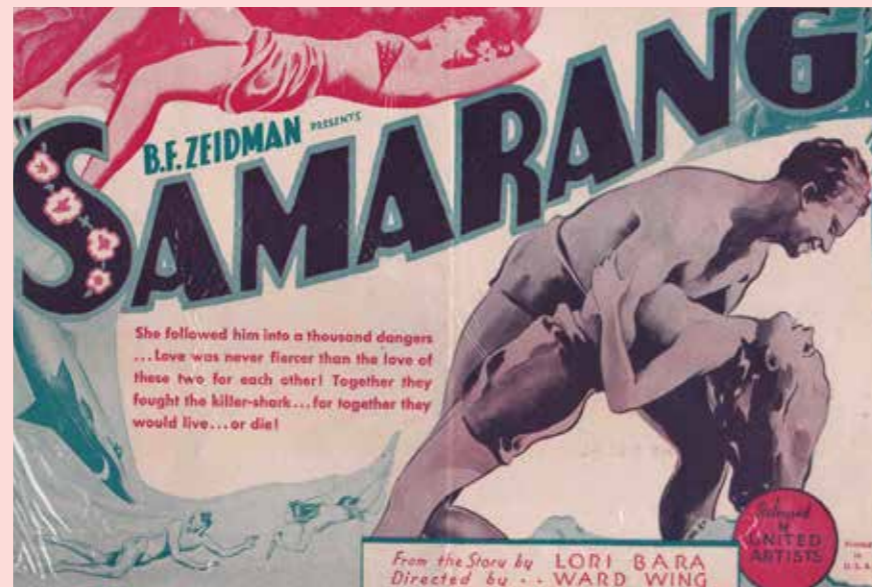
(Above) Poster of Samarang . © Samarang. Directed by Ward Wing, produced by United Artists and B.F. Zeidman, distributed by United Artists. United States, 1933. (Right) Advertisements for the opening of Leila Majnun (1934).

When Liu returned home three months later, he was inspired to produce