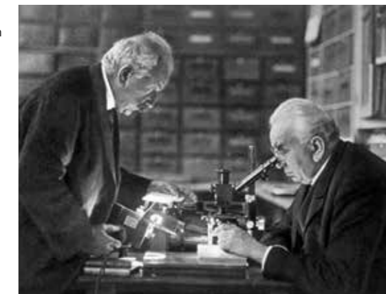
(Above right) The Serpentine Dance, a form of burlesque, was one of the first vignettes screened at the Adelphi Hall in 1897. © The Serpentine Dance. Directed by Louis Lumiere, produced by Lumiere. France, 1897. (Right) Frenchmen August and Louis Lumiere were one of the first filmmakers in history.