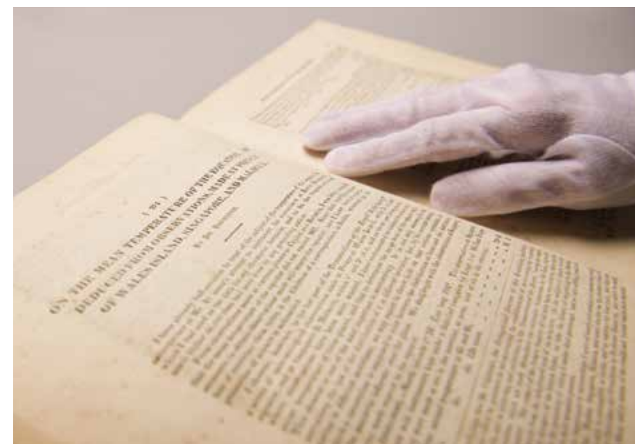
(Top) "Journal of a Voyage Round the Island of Singapore" gives an account of John Crawfurd's formal possession of Singapore and its adjacent islands in 1825. Image source: National Library Board, Singapore. (Above) The article "Treaty between the Britannic and Netherland Governments, March 1824" lists the terms of the Anglo-Dutch Treaty signed between the British and the Dutch on 17 March 1824. Image source: National Library Board, Singapore.

Philippines, East Timor and Singapore – that were republished from newspapers or journals, including many from Singapore Chronicle , Singapore's first English newspaper (see page 114). Moor was a former editor 3 of the Chronicle , of which no known copies from 1824 to 1826 remain; 4 his publishing project therefore preserved some precious articles that would otherwise have been lost forever.