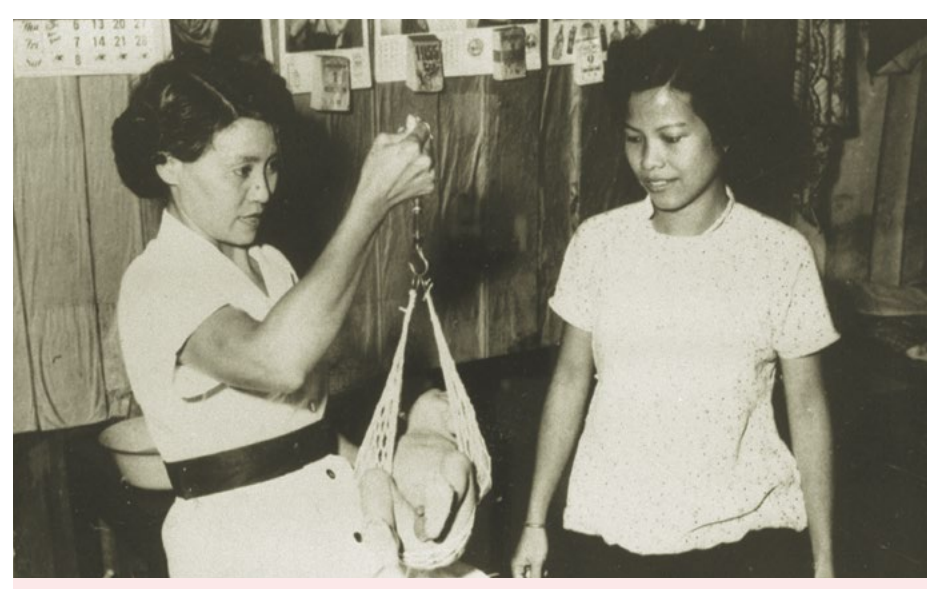
This 1950 photo shows a midwife weighing a newborn baby at home. As hospital beds in maternity hospitals were in short supply in the 1950s, women were discharged 24 hours after their babies were born. Midwives would visit these new mothers at their homes to provide postnatal care.

The nursing profession, as most people will readily admit, is one of the toughest in the world; it is a calling that requires dedication and a certain steadfastness of spirit. While nurses today face many challenges on a daily basis, it was much worse back in the 1920s. Nurses were expected to perform six weeks of continuous morning and afternoon shifts, followed by two weeks of night duty. Rest days were scant: student nurses were given one off day per month, while staff nurses had two days. Nurses were also required to live in hospital quarters and have their meals there. Each staff nurse was entitled to her own bedroom, whereas student nurses had to share a room with two other fellow students. Perhaps the most draconian ruling was that nurses working in government hospitals in the 1920s were not allowed to get married. We do not know how long this rule was enforced, but it is little wonder that the profession had difficulties attracting women.