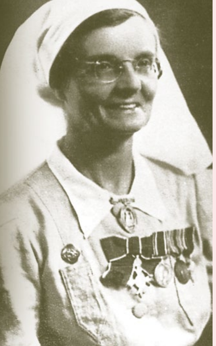
In 1927, Singapore's first public health nurse, Ida M. M. Simmons from Scotland, was employed to provide infant and maternal health services to mothers and infants in rural areas. All rights reserved, Ministry of Health. (1997). More than a Calling: Nursing in Singapore Since 1885 Singapore: Ministry of Health.

Nurses' Week was celebrated for the first time in Singapore in May 1965. Held annually for nearly two decades,