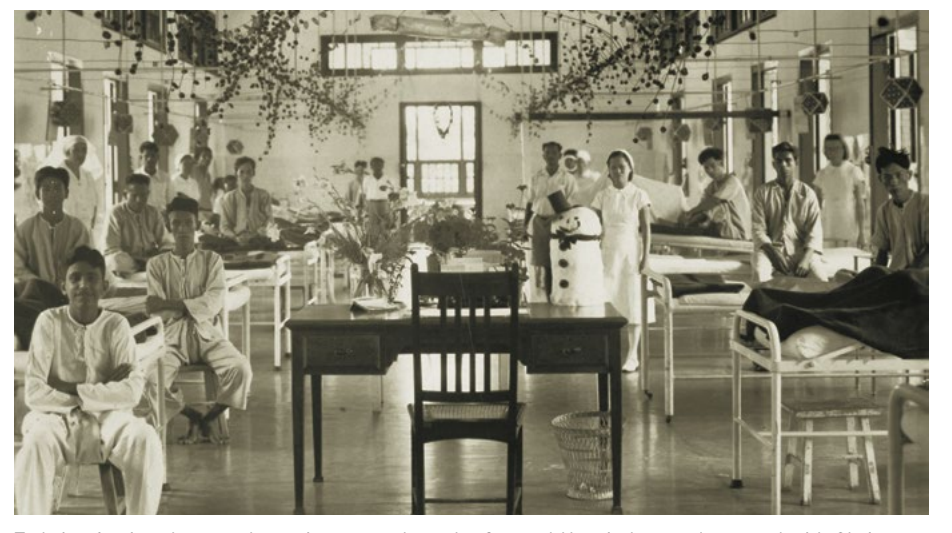
To bring festive cheer to the patients, wards at the General Hospital were decorated with Christmas trimmings, circa 1930s.

The student nurses, who were recruited on an apprenticeship model, were sent directly to the hospital wards to work and receive on-the-job training. Learning was through observation,