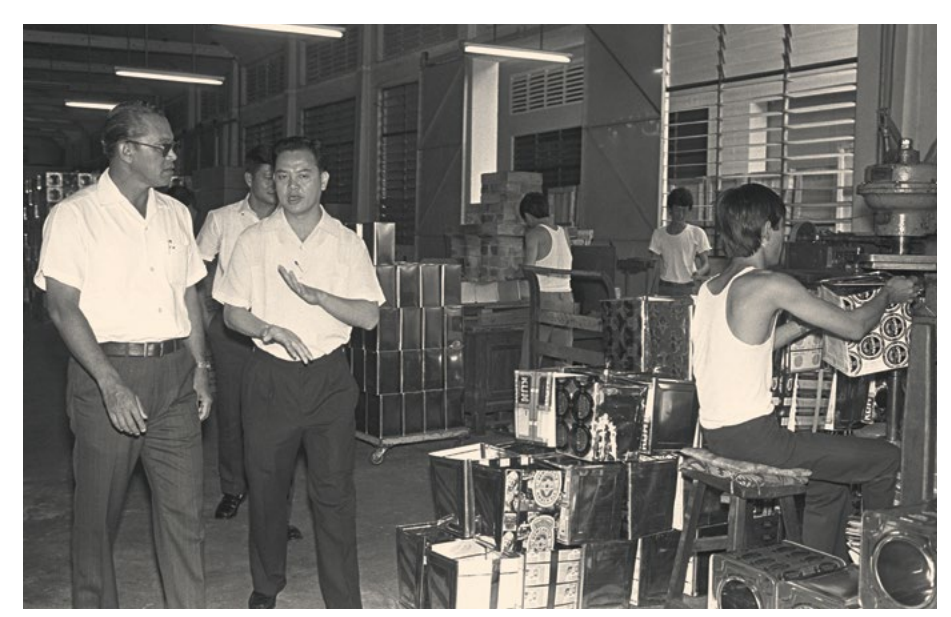
Then Minister for Social Affairs Othman Wok (extreme left) visits the factory of Thye Hong Biscuit in 1975.

In 1971, one of Britain's largest biscuit manufacturers, Huntley and Palmer, entered into an agreement with Thye Hong to produce part of its range of sweet and semi-sweet biscuits in Singapore and