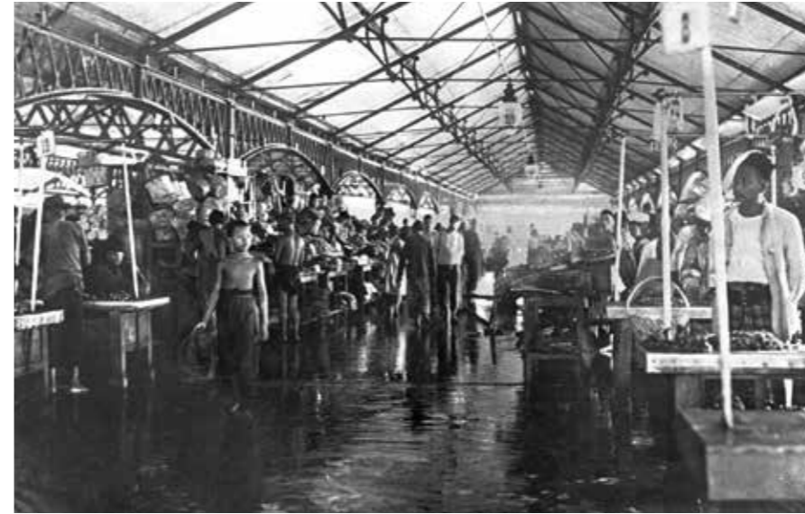
The interior of Telok Ayer Market showing the cast iron by MacFarlane and Company in Glasgow, 1910s. The market (more popularly known today as Lau Pa Sat or "Old Market" in Hokkien) opened in 1894.