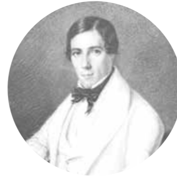
Residents of Singapore: Farquhar and Crawfurd