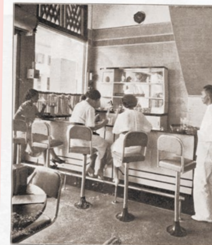
An advertisement for one of several Magnolia Milk Bar outlets operated by Cold Storage back in 1938. Two of its most popular outlets were found in Orchard Road and at Capitol Theatre, at the junction of Stamford and North Bridge roads. Image reproduced from Come to Malaya and Travel by Train, November 1938 (p. 44). (1938). Singapore: East Indies Pub. [Accession no.: B20025405G; Microfilm no.: NL29343].