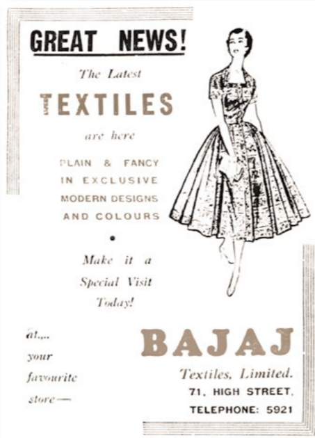
Bajaj Textiles – which relocated from Raffles Place to High Street – advertising its latest textiles.

Shopfronts of Metro and Wassiamull’s at High Street, another popular shopping hub from yesteryear, 1964.