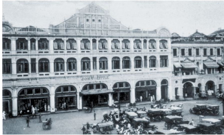
John Little department store at Raffles Place, 1930. Its facade inspired the design of Raffles Place MRT station's entrances.

On the morning of the sale, long queues of people would snake outside the store, eagerly waiting for it to open. The Singapore Standard and other newspapers would publish photographs of huge crowds at the annual sales events of Robinson's, John Little and Gian Singh.