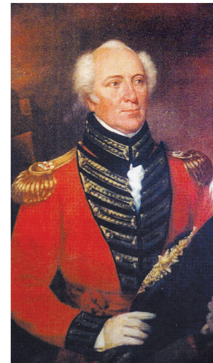
(Above) Colonel William Farquhar, c. 1830.