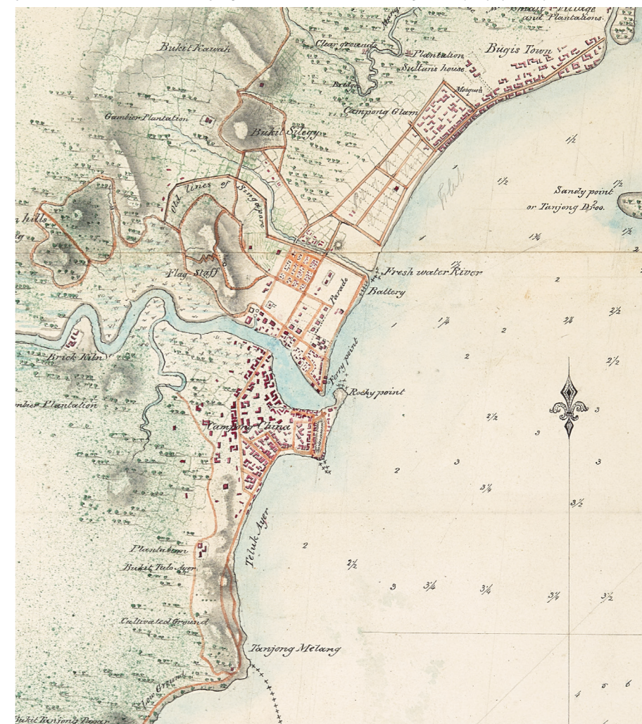
“Map of the Town and Harbour of Singapore” drawn by William Farquhar between 1821 and 1822, and presented to the East India Company in 1825.