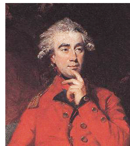
(Left) A painting of Francis Edward Rawdon-Hastings, first Marquess of Hastings, Governor-General of India (1813-23), by Joshua Reynolds.

Raffles did not purchase the island of Singapore, nor acquire it for Britain as often claimed. Indeed, the acquisition was far from guaranteed. After appointing Farquhar Resident and Commandant as ordered by Hastings, Raffles gave Farquhar a list of instructions and departed for Penang on 7 February 1819.