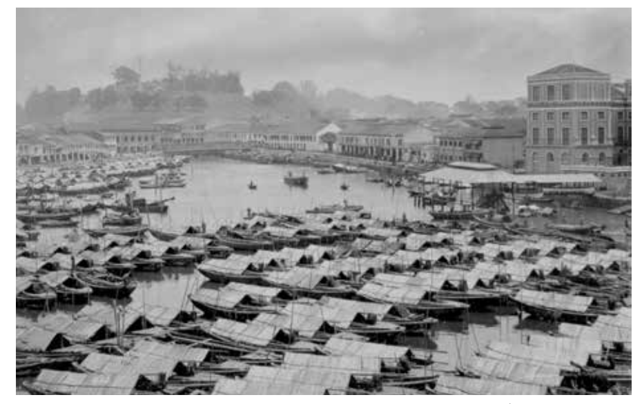
(Facing page top) A large crude carrier at Sembawang Shipvard's new Premier Dock, a $50-million, 400,000dwt drydock, at its official opening by then Prime Minister Lee Kuan Yew in May 1975.

The use of steamships also required new logistical arrangements. Coal, the energy source of steamships, had to be first transferred from coal-carrying ships anchored at the mouth of the Singapore River onto small lighters, which in