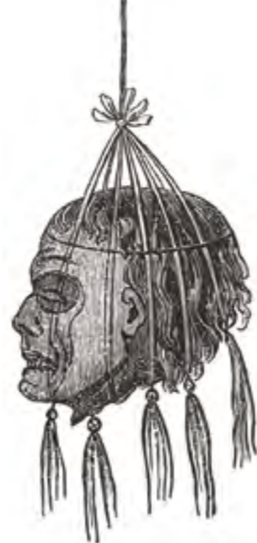
A Dayak head. Image reproduced from Marryat, F.S. (1848). Borneo and the Indian Archipelago: With drawings of costume and scenery . London: Longman, Brown, Green, and Longmans.

"... it has a natural curiosity to show which no geologist I think has been able satisfactorily to explain. The masses of rock on the sea-shore – namely, instead of being smoothed and rounded as they usually are when constantly washed over by the tides – are angular, sharp-edged,