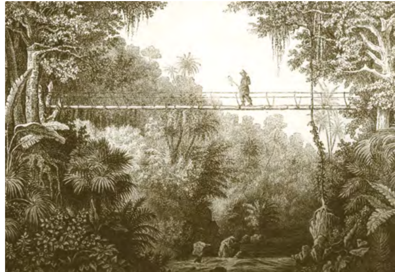
(Below) Ida Pfeiffer crossing Dayak bamboo bridge in Sarawak with a butterfly net in hand. Image reproduced from Pfeiffer, I. (1856). Meine zweite Weltreise (vol. II) . Vienna: Gerold.