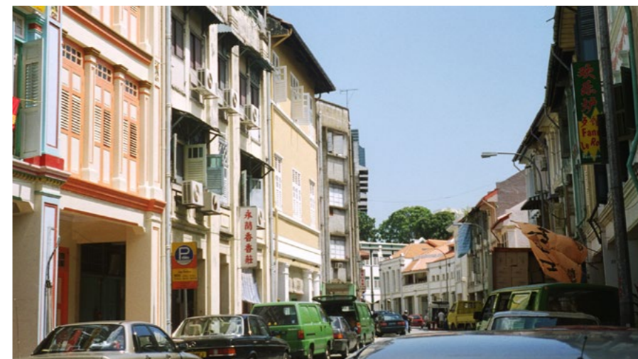
Shophouses on Keong Saik Road, 1997.