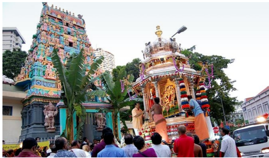
Devotees at the Sri Layan Sithi Vinayagar Temple welcoming the silver chariot bearing Lord Murugan that has just arrived from the Sri Thendayuthapani Temple. The annual procession is called Punar Pusam and takes place the day before Thaipusam.

The shophouse where the Indian coolies lived was close to the Sri Layan Sithi Vinayagar Temple at 73 Keong Saik Road. During the Thaipusam festival that takes place between 14 January and 14 February each year, Keong Saik Road becomes a hive of activity. The Sri Layan Sithi Vinayagar Temple plays an important role in the run-up to Thaipusam. On the eve of the festival, at about 6 am, a silver chariot from the Sri Thendayuthapani Temple on Tank Road makes it way to the Sri Layan Sithi Vinayagar Temple during a procession known as Punar Pusam. The chariot bears Lord Murugan, the Hindu god of war, and it stays at the Sri Layan Sithi Vinayagar