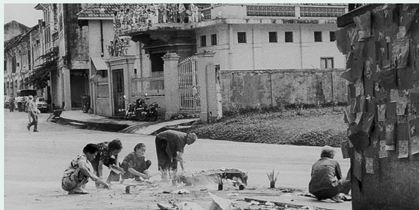
Women "beating the little people" on Keong Saik Road, 1950s. The Cantonese believe that the ritual would ward off evil and banish negativity in one's life. In the background is the Sri Layan Sithi Vinayagar Temple before it was renovated into the current structure.

and Guangdong. It usually took place at road intersections, under bridges, and at the foot of a hill or mountain as these places were generally perceived to have bad fengshui and thus prone to the influence of evil spirits.