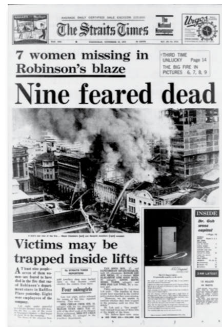
The Straits Times put the news of the Robinsons fire on the front page. The Straits Times , 22 November 1972, p. 1. Retrieved from NewspaperSG.