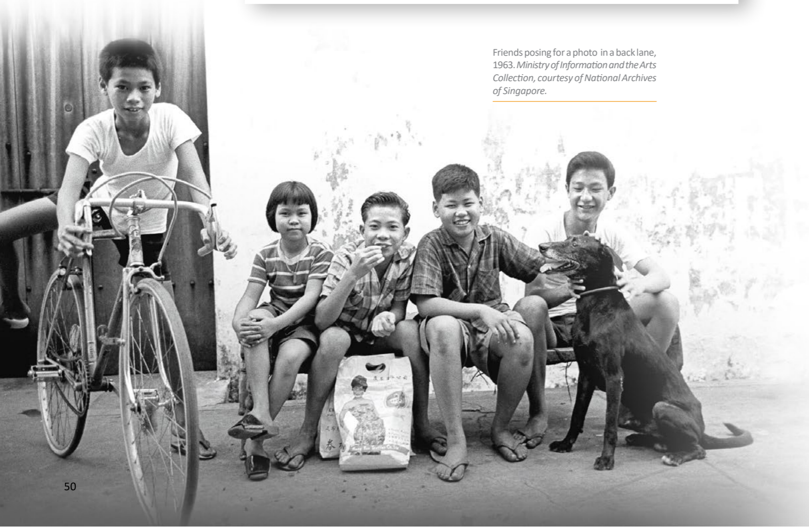
Friends posing for a photo in a back lane, 1963.