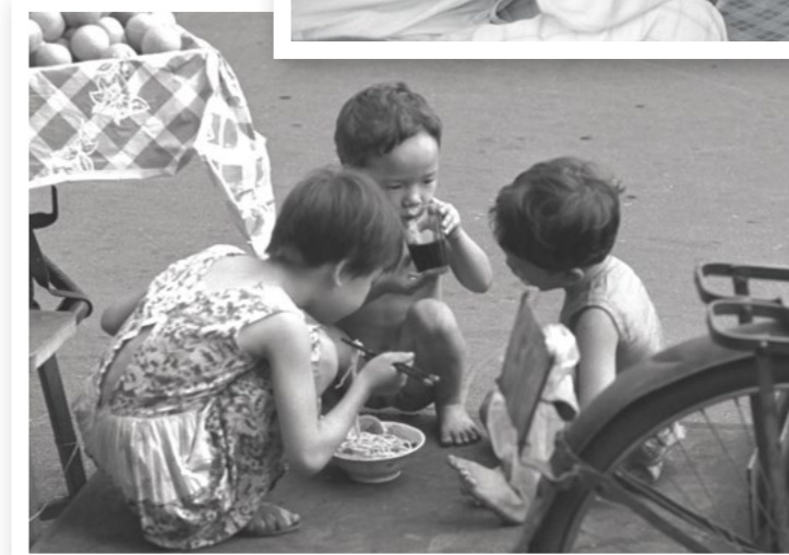
Sharing a bowl of noodles by the roadside, 1962.