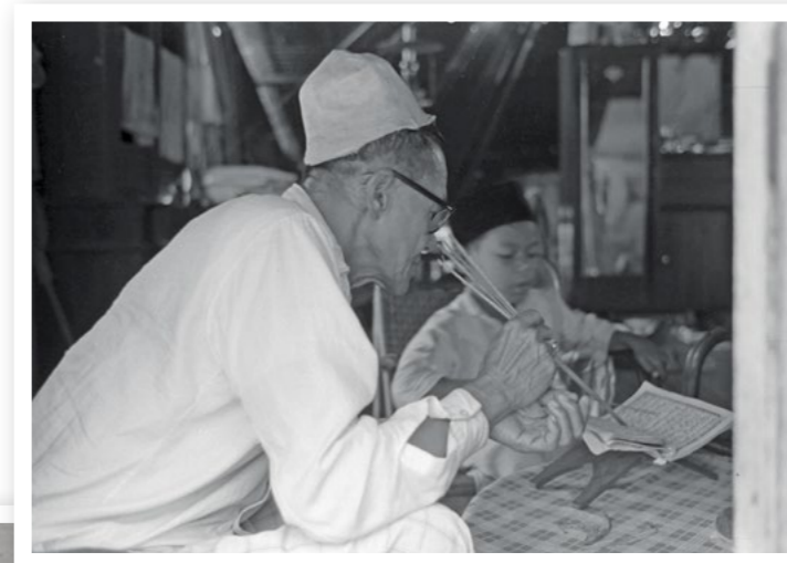
Qur'an lesson, Katong, 1962. In 1959, there were 12 madrasah (Islamic religious schools) in Singapore, increasing to 28 by 1962.