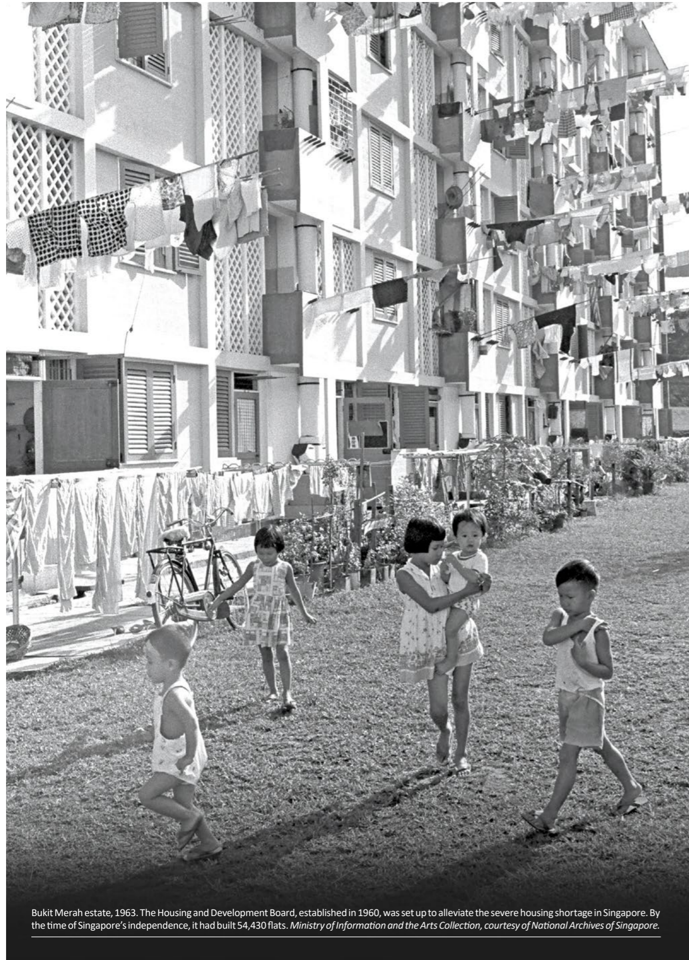
Bukit Merah estate, 1963. The Housing and Development Board, established in 1960, was set up to alleviate the severe housing shortage in Singapore. By the time of Singapore's independence, it had built 54,430 flats.