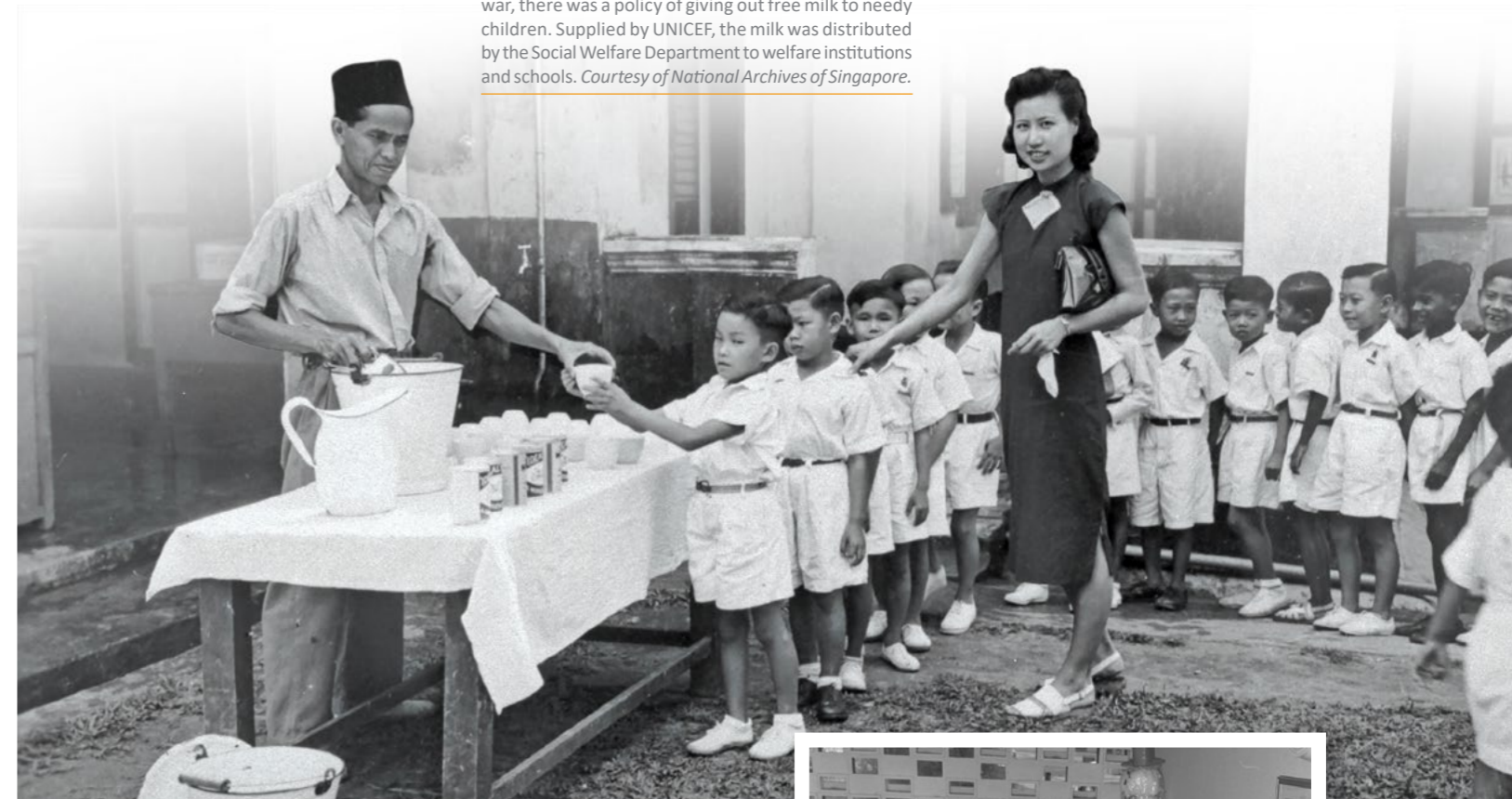
Free milk for children during recess, 1950s. After the war, there was a policy of giving out free milk to needy children. Supplied by UNICEF, the milk was distributed by the Social Welfare Department to welfare institutions and schools.