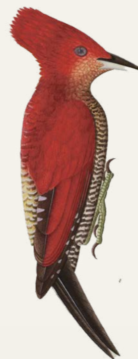
N° 11: Banded Woodpecker Chrysophlegma miniaceum

On 1 June 1820, Stamford Raffles wrote about the Green Broadbill in his Descriptive Catalogue of a Zoological Collection thus: “Found in the retired parts of the forests of Singapore and of the interior of Sumatra.” There are two depictions of this broadbill in the collection. They are nearly identical, differing only in the composition of the tuft of feathers on the forehead. In both drawings, the birds are male, as indicated by the small yellow spots above their eyes. From Raffles' catalogue entry, it can be inferred that he must have procured at least two specimens, one from Singapore and another from the environs of Bencoolen (Bengkulu) in Sumatra. Diard, Duvaucel and William Jack (a botanist working with Raffles) could have collected the Singapore specimen during their visit in 1819. This species has the distinction of being the first bird from Singapore to be given a scientific name.