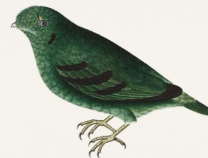
N° 34: Green Broadbill Calyptomena viridis

Diard & Duvaucel: French Natural History Drawings of Singapore and Southeast Asia 1818–1820 is available for reference at the Lee Kong Chian Reference Library and for loan at selected public libraries (Call nos.: RSING 508.0222 DIA and SING 508.0222 DIA) and for sale at all major bookstores, including Epigram's online store at epigrambookshop.sg .