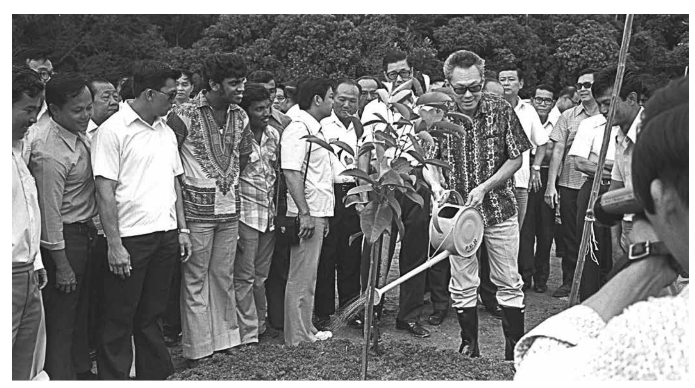
Prime Minister Lee Kuan Yew watering the jambu laut sapling that he had just planted in Tanjong Berlayar, 1975. Tree Planting Day was made an annual event in 1971.

Mount Faber Scenic Park and the garden above Raffles Square underground carpark were built.<sup>20</sup> The government also launched a tree planting campaign in 1963. However, Singapore would not have an official greening policy until the "Garden City" vision articulated by then Prime Minister Lee Kuan Yew in 1967.<sup>21</sup>