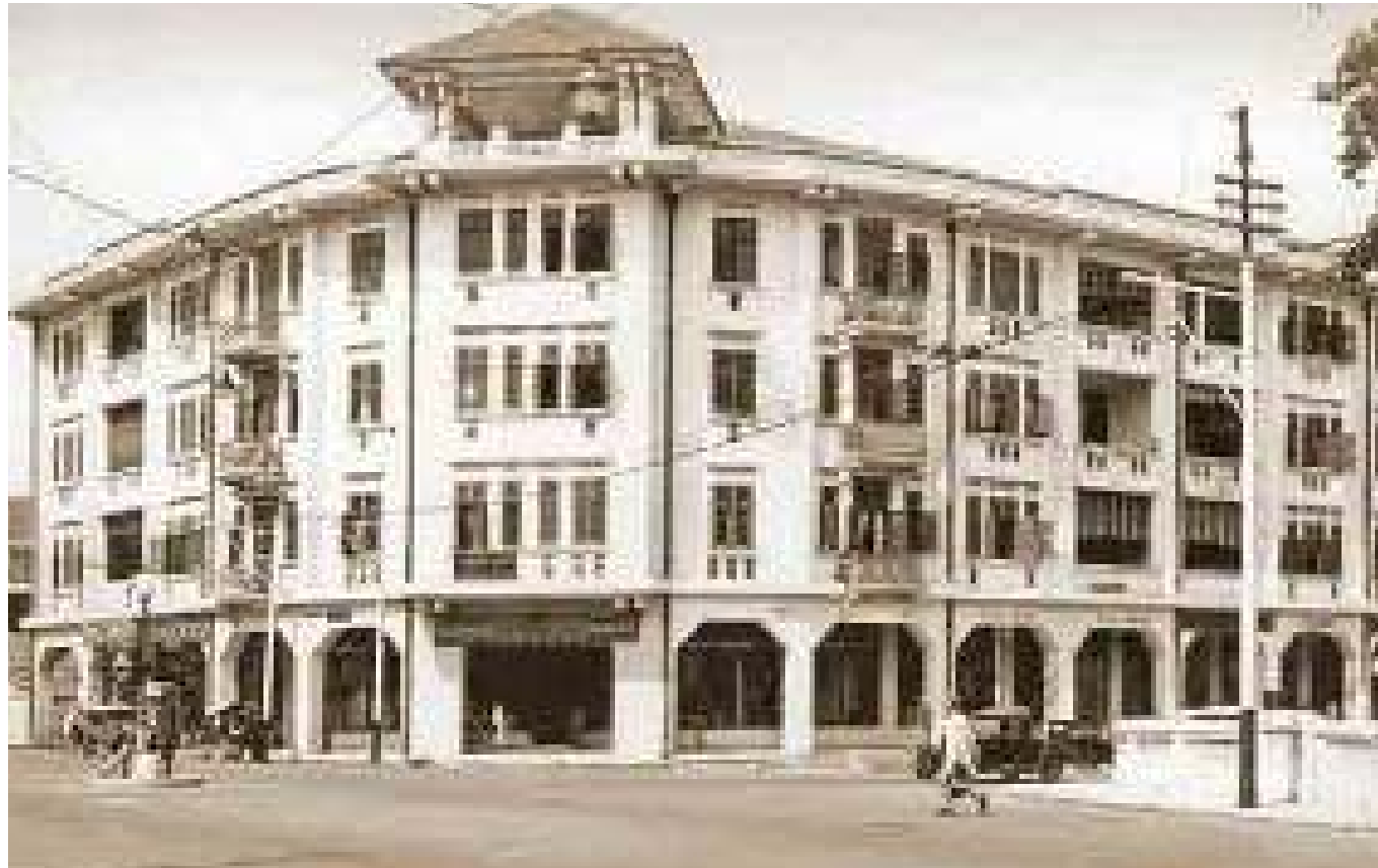
(Top) Institution Hill Mansions, River Valley Road, 1920. This building was primarily intended as accommodation for United Engineers' expatriate staff members, and surplus units were made available for rent to members of the general public. Courtesy of Glen Christian.

(Above) Eu Court at the corner of Hill Street and Stamford Road, c. 1930. Courtesy of Glen Christian.