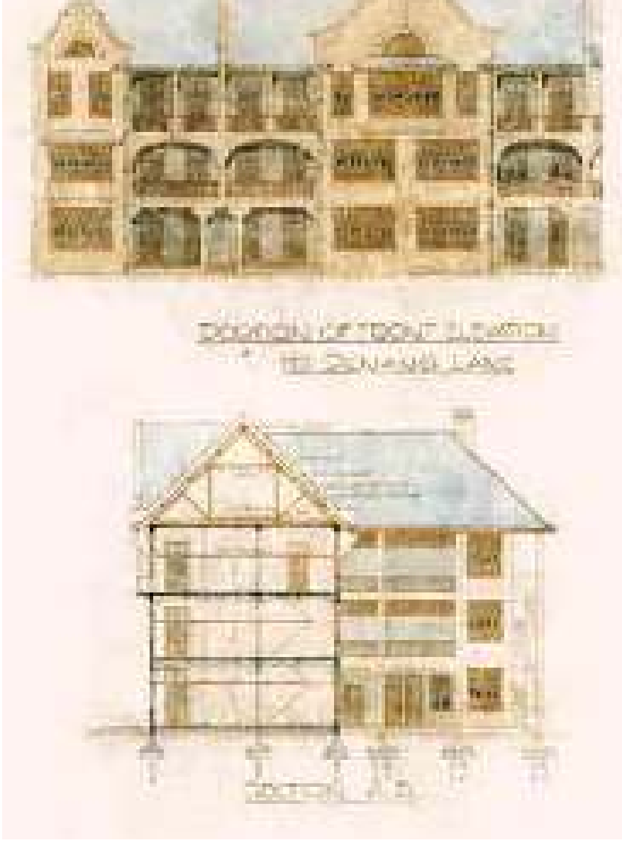
(Facing page) Amber Mansions, Orchard Road, c. 1922. The Cape Dutch Revival-style elevations of Amber Mansions almost certainly point to Denis Santry as the author of this building, the architect having previously worked in South Africa during a period when a revival of traditional Cape Dutch architecture was at its height.

Drawings submitted to the Municipality for planning permission reveal that Amber Mansions was originally intended to be entirely residential, but subsequently the ground floor was remodelled to be rented out as commercial premises – Malayan Motors and the Municipal Gas Department were among the first tenants. Several of the residential units on the floors above were