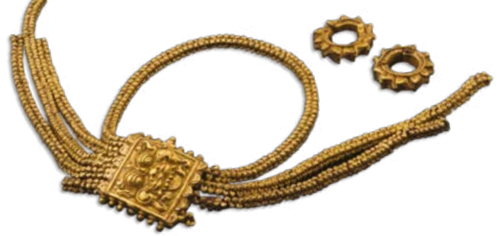
Javanese-style gold jewellery dating back to the Majapahit period was discovered at Fort Canning in Singapore during excavation works in 1928.

addition, scholars have begun to collate historical, ethnographic and archaeological data on gold and present these as part of a geographic information system to analyse gold trade networks.53