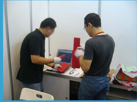
Two 'virtual donations' being processed at the on-site digital studio. The original items were then returned to their

so that more users will be able to access the digitised copy without having to handle the original.