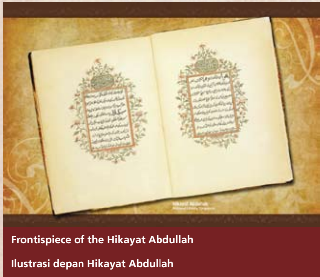
Frontispiece of the Hikayat Abdullah

National Library of Australia. (2001). Treasures from the world's great libraries . Canberra: National Library of Australia.