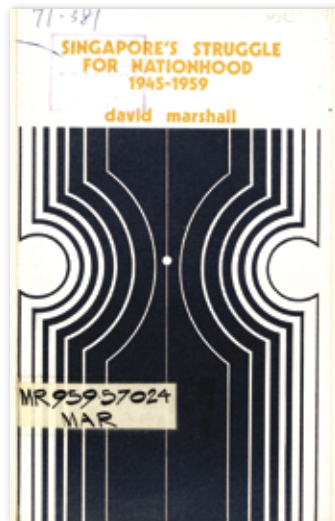
All rights reserved, University Education Press, 1971