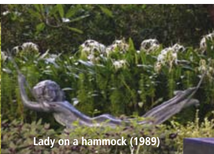
Lady on a hammock (1989)