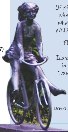
Girl on a bicycle (1987)

by David Marshall (undated) ISEAS Library: David Marshall Private Papers Collection