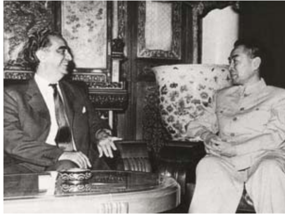
David Marshall with Premier Zhou Enlai

After his distinguished achievements as an Ambassador for 15 years from 1978 to 1993, Marshall continued his connection with the legal profession by becoming a consultant to the established law firm, Drew and Napier in October 1993. He embraced his new post with enthusiasm, saying that it gave him a new lease in life.