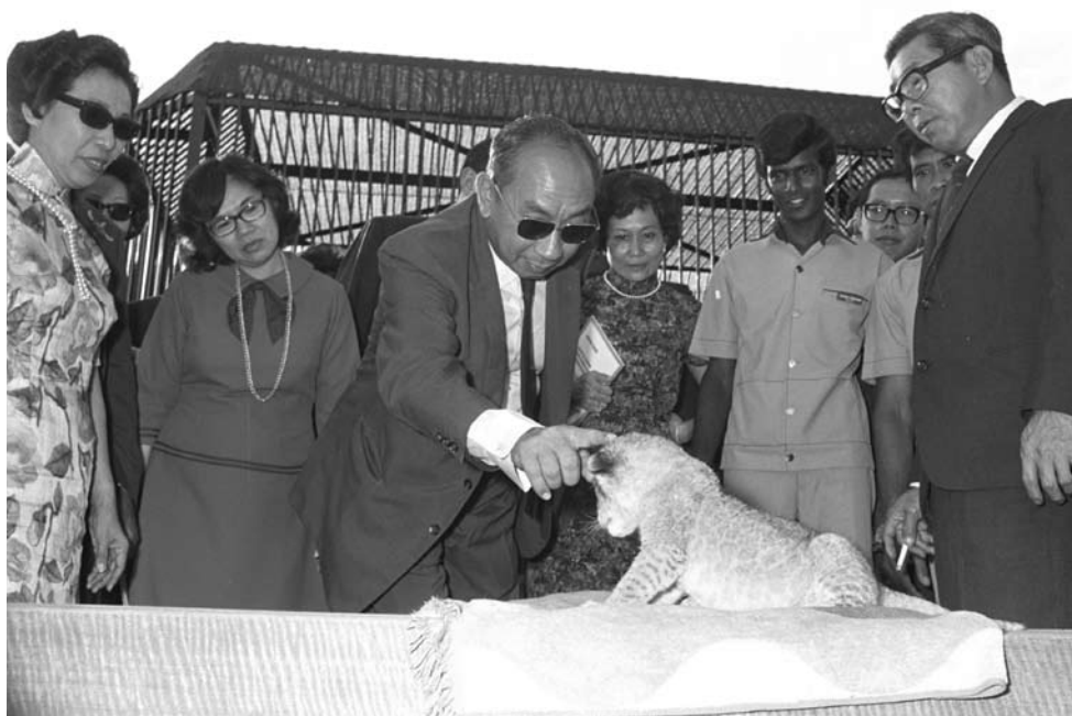
Dr Goh at the opening of the Singapore Zoological Gardens in 1973.

How are practitioners to be judged? In Dr Goh’s own words, “a practitioner is not [like the theoretician] judged by the rigour of his logic or by the elegance of his presentation. He is judged by results.” By 1972, “Singaporeans knew that they could make the grade. While we had not reached the mythical Promised Land, we had not only survived our misfortunes but became stronger and wiser in the process. As a result we