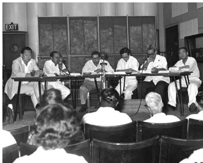
Then Prime Minister Lee Kuan Yew with Dr Goh and members of the opposition parties taking part in a radio Singapore forum on merger referendum, 1962.

Dr Goh's public career is amply documented in the open public records. His accomplishments after assuming office as Singapore's first Minister for Finance in 1959 were also recorded comprehensively. His pronouncements as a Member of Parliament for Kreta Ayer Constituency from 1959 to 1984 are contained in Hansard. His policy statements during his various tenures as Minister of Finance, Defence and Education are necessary reading for an appreciation of Dr Goh's analyses of the challenges he perceived as