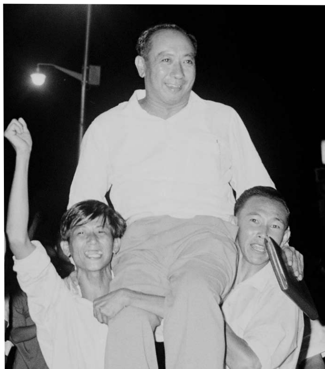
Dr Goh chaired after a 4,413 victory at Kreta Ayer in 1963.

Remembering Dr Goh is not an objective task of merely compiling sources from the different categories in order to derive a composite portrayal of Dr Goh that is comprehensive and as far as possible, true. Rather, it is a complex process in which the different sources interact with and impact each other. Our remembrance of Dr Goh's contributions to the making of "The Singapore Story" may evolve and change if and when the official public records are opened. Our personal memories of Dr Goh are probably the most problematic. On the one hand they are the remembrances that are most likely to change over time and become embellished with other memories and evidence with each recounting. On the other hand, they are of greater significance in helping us to gain an understanding of the finer nuances of a complex public personality than is contained within both the official public records and in Dr Goh's own recorded perceptions of himself. ■