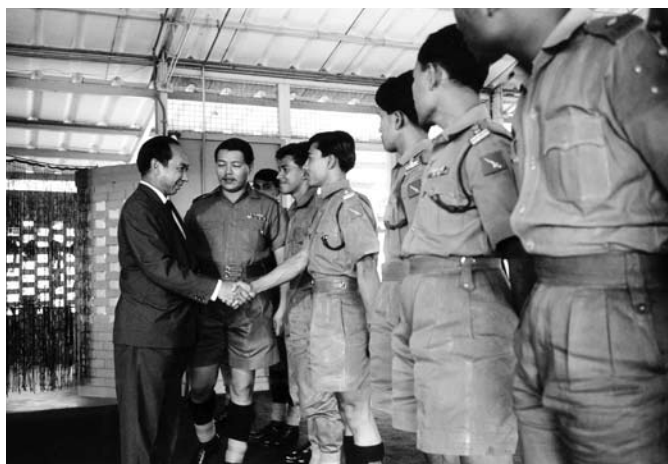
Dr Goh Keng Swee meeting 1st and 2nd Singapore Infantry Regiments, 1965.

Post 1965, Dr Goh's role broadened to include the defence