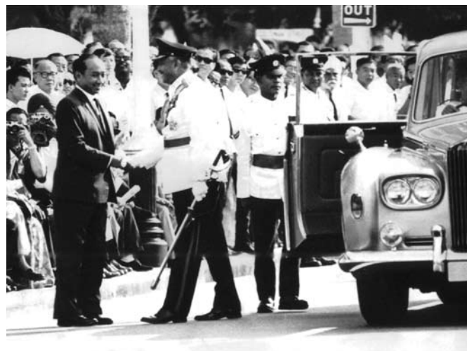
National Day Parade at the Padang, 1966. Dr Goh receiving then President Yusof Ishak.

We can speculate as to why Dr Goh chose to reveal this in 1996. Was it that in 1996, when Singapore was taxiing towards economic take-off to global city status, it could finally be revealed that separation was a blessing in disguise?