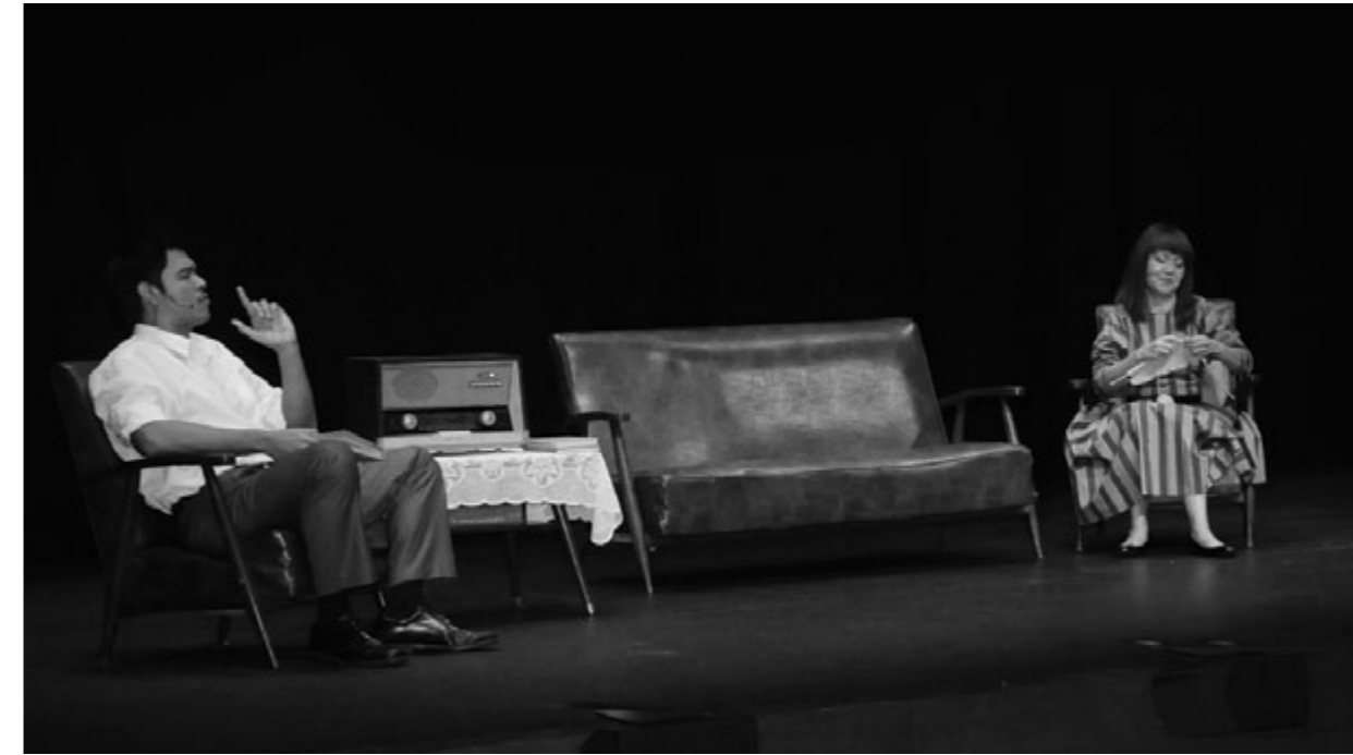
During the book launch of The Singapore Lion on 4 February 2010, The Necessary Stage put up an adapted version of Rajaratnam's radio plays from the series A Nation in the Making . It was the first time that the plays had been performed on stage.

In Singapore, our brand of multiculturalism is an ongoing experiment. The Singaporean Singapore that founding leaders such as Rajaratnam envisaged for this land of immigrants is one that embraces immigrants