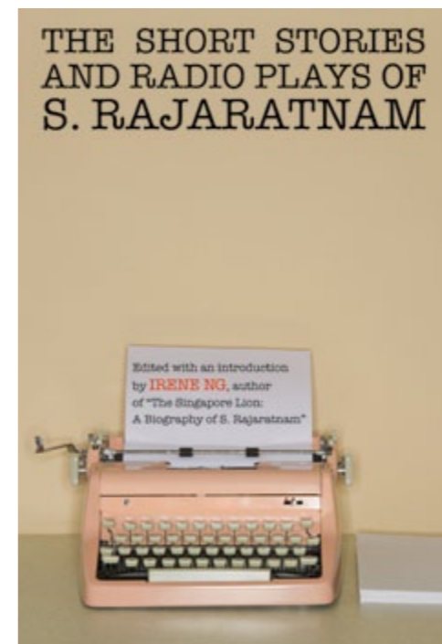
The Short Stories and Radio Plays of S. Rajaratnam (2011) is an anthology of Rajaratnam's early literary works.

By the time he left London 12 years later in 1947, he was a changed man—a man with a political vision with strong convictions in